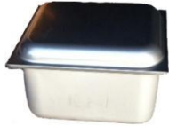
1. Goodflo Casing