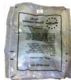
2. Goodflo G-Bag